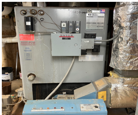
TK -12 Student Enrollment Trends